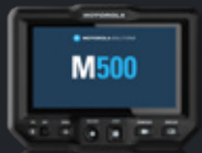
M5D CONTROL PANEL