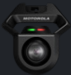
M5F FRONT CAMERA